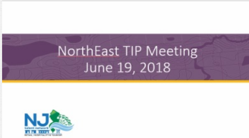
NorthEast TIP Meeting June 19, 2018